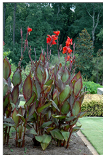
Australia Canna in bloom

7800 Roblin Boulevard Headingley, MB R4H 1B6