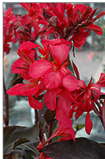
Australia Canna flowers

This plant should only be grown in full sunlight. It requires an evenly moist well-drained soil for optimal growth, but will die in standing water. It is not particular as to soil pH, but grows best in rich soils. It is highly tolerant of urban pollution and will even thrive in inner city environments, and will benefit from being planted in a relatively sheltered location. Consider applying a thick mulch around the root zone in winter to protect it in exposed locations or colder microclimates. This particular variety is an interspecific hybrid. It can be propagated by division; however, as a cultivated variety, be aware that it may be subject to certain restrictions or prohibitions on propagation.