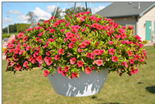
Superbells Tabletop Red Calibrachoa in bloom