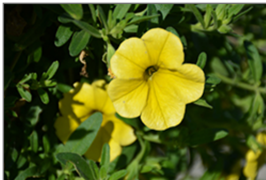
MiniFamous Neo Deep Yellow Calibrachoa flowers

MiniFamous Neo Deep Yellow Calibrachoa is a dense herbaceous annual with a trailing habit of growth, eventually spilling over the edges of hanging baskets and containers. Its medium texture blends into the garden, but can always be balanced by a couple of finer or coarser plants for an effective composition.