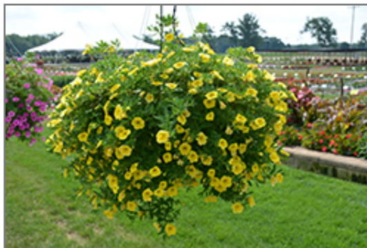
MiniFamous Neo Deep Yellow Calibrachoa in bloom