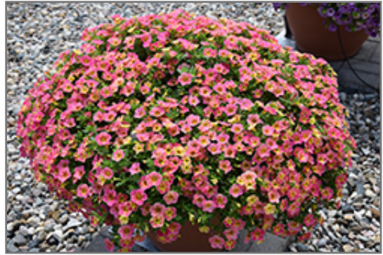
Chameleon Sunshine Berry Calibrachoa in bloom