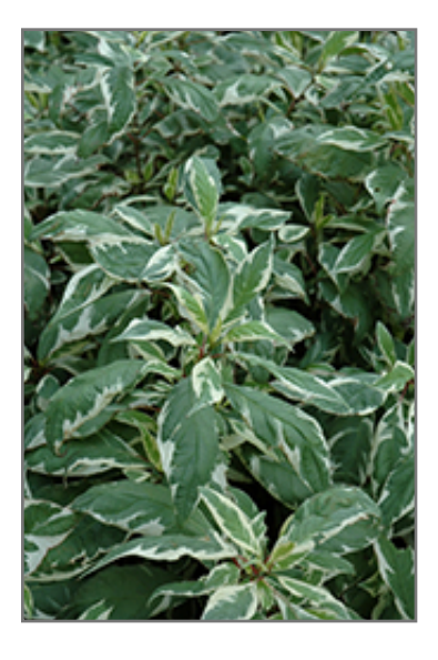
Cream Cracker Dogwood foliage

Cream Cracker Dogwood is a multi-stemmed deciduous shrub with a more or less rounded form. Its average texture blends into the landscape, but can be balanced by one or two finer or coarser trees or shrubs for an effective composition.