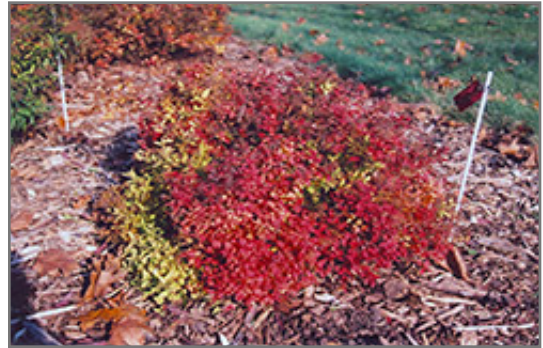
Dakota Goldcharm Spirea in fall

This shrub should only be grown in full sunlight. It prefers to grow in average to moist conditions, and shouldn't be allowed to dry out. It is not particular as to soil type or pH. It is highly tolerant of urban pollution and will even thrive in inner city environments. This is a selected variety of a species not originally from North America.