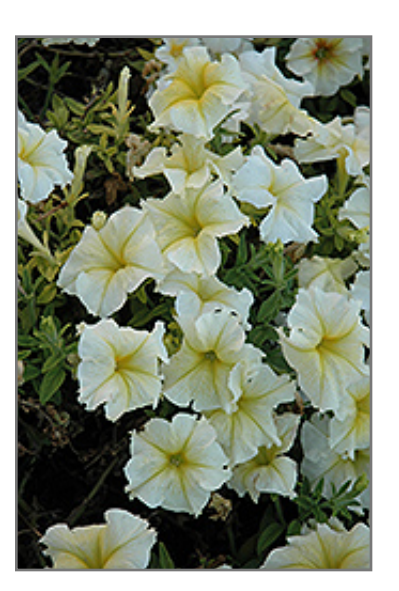
Paparazzi Glitz Yellow Petunia flowers

Paparazzi Glitz Yellow Petunia will grow to be about 12 inches tall at maturity, with a spread of 14 inches. When grown in masses or used as a bedding plant, individual plants should be spaced approximately 12 inches apart. Its foliage tends to remain dense right to the ground, not requiring facer plants in front. This fast-growing annual will normally live for one full growing season, needing replacement the following year.