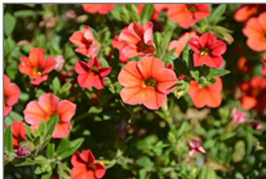
Can-Can Orange Calibrachoa flowers

Can-Can Orange Calibrachoa is a dense herbaceous annual with a trailing habit of growth, eventually spilling over the edges of hanging baskets and containers. Its medium texture blends into the garden, but can always be balanced by a couple of finer or coarser plants for an effective composition.