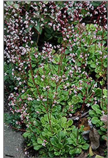
London Pride in bloom