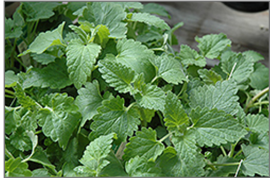
Catnip foliage