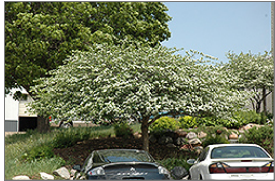
Thornless Hawthorn in bloom