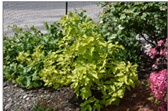
Neon Burst Dogwood