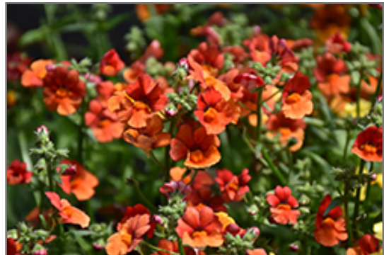
Sunsatia Blood Orange Nemesia flowers