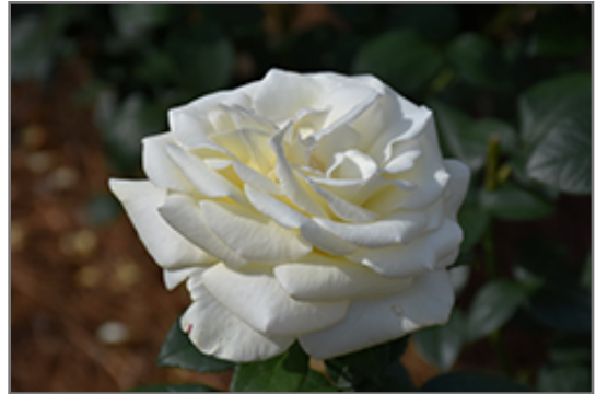
Sugar Moon Rose flowers