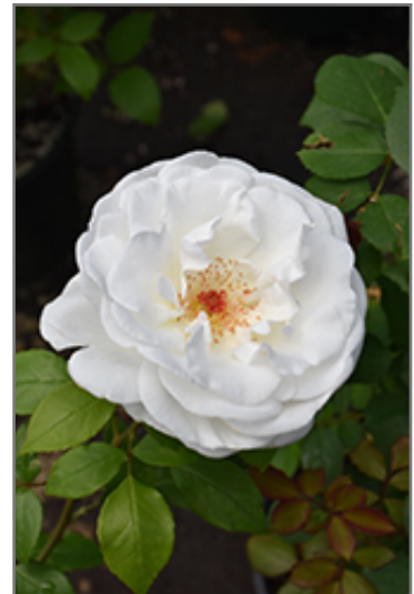
Sugar Moon Rose flowers