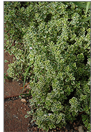
Aureus Lemon Thyme foliage