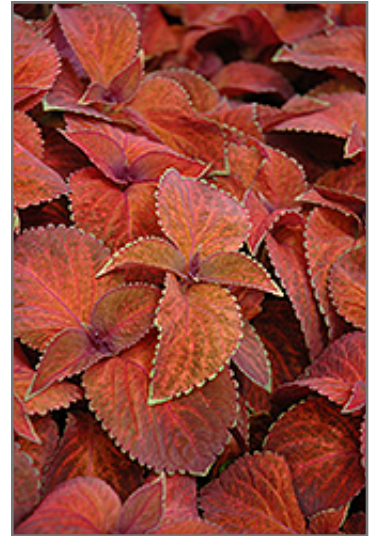
Wizard Sunset Coleus foliage

Wizard Sunset Coleus is recommended for the following landscape applications;