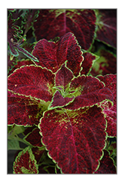
ColorBlaze Dipt in Wine Coleus foliage

Minneapolis, 6010 Lyndale Ave. S. | Maplewood, 2600 White Bear Ave. N. | Apple Valley, 7955 150th St. W. Plymouth, 10050 6th Ave. N. | Eden Prairie, 770 Prairie Center Dr. | Fridley, 8200 University Ave. NE. Bachmans.com