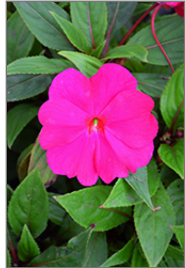
Divine Violet New Guinea Impatiens flowers

Divine Violet New Guinea Impatiens is recommended for the following landscape applications;