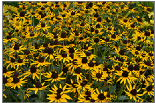
Little Goldstar Rudbeckia flowers