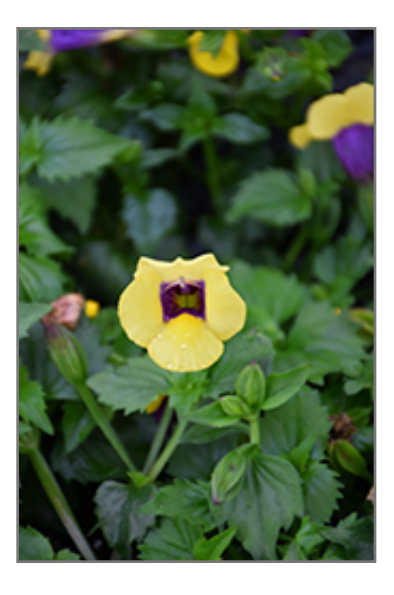
Catalina Gilded Grape Torenia flowers

Catalina Gilded Grape Torenia is recommended for the following landscape applications;