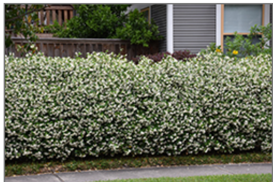
Confederate Star-Jasmine in bloom