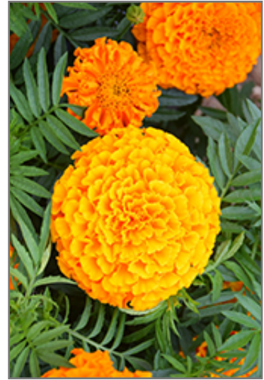
Taishan Orange Marigold flowers