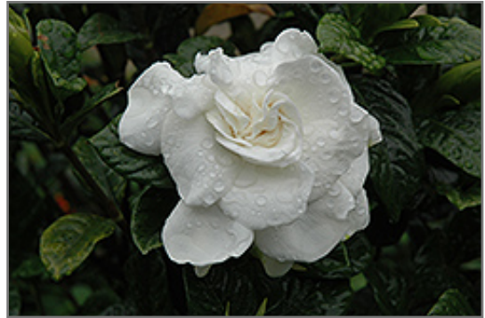
Everblooming Gardenia flowers