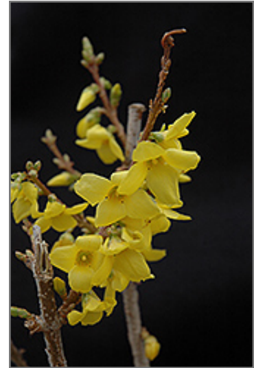
Show Off Forsythia flowers

Show Off Forsythia makes a fine choice for the outdoor landscape, but it is also well-suited for use in outdoor pots and containers. With its upright habit of growth, it is best suited for use as a 'thriller' in the 'spiller-thriller-filler' container combination; plant it near the center of the pot, surrounded by smaller plants and those that spill over the edges. It is even sizeable enough that it can be grown alone in a suitable container. Note that when grown in a container, it may not perform exactly as indicated on the tag - this is to be expected. Also note that when growing plants in outdoor containers and baskets, they may require more frequent waterings than they would in the yard or garden. Be aware that in our climate, most plants cannot be expected to survive the winter if left in containers outdoors, and this plant is no exception. Contact our experts for more information on how to protect it over the winter months.