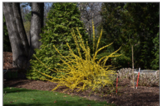
Show Off Forsythia in bloom