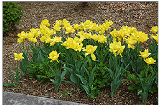
Monte Carlo Tulip in bloom

7800 Roblin Boulevard Headingley, MB R4H 1B6