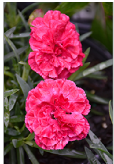
Fruit Punch Raspberry Ruffles Pinks flowers