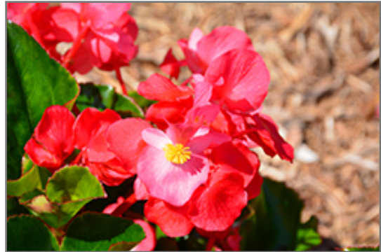
Whopper Rose Green Leaf Begonia flowers

Whopper Rose Green Leaf Begonia is an herbaceous annual with a mounded form. Its medium texture blends into the garden, but can always be balanced by a couple of finer or coarser plants for an effective composition.