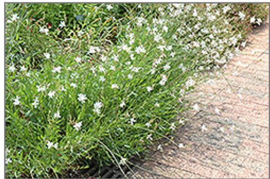
Whirling Butterflies Gaura in bloom