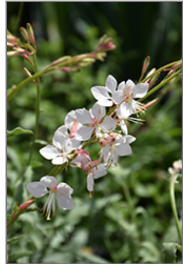
Whirling Butterflies Gaura flowers

Whirling Butterflies Gaura is an open herbaceous annual with tall flower stalks held atop a low mound of foliage. It brings an extremely fine and delicate texture to the garden composition and should be used to full effect.