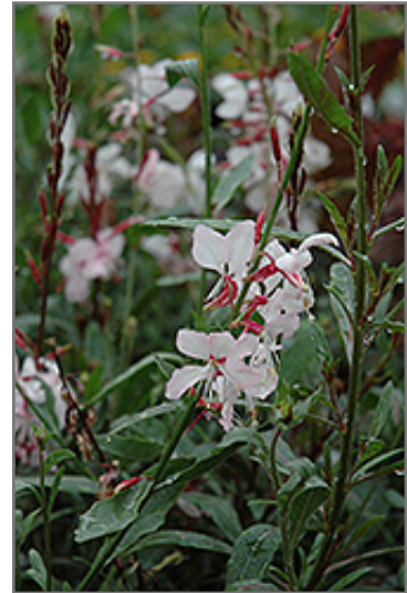
Ballerina Blush Gaura flowers

This is a relatively low maintenance plant, and is best cleaned up in early spring before it resumes active growth for the season. It is a good choice for attracting butterflies to your yard, but is not particularly attractive to deer who tend to leave it alone in favor of tastier treats. It has no significant negative characteristics.