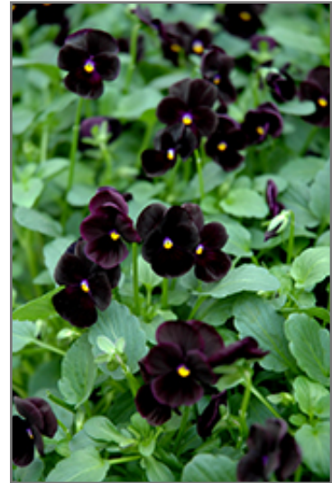
Sorbet Black Delight Pansy flowers