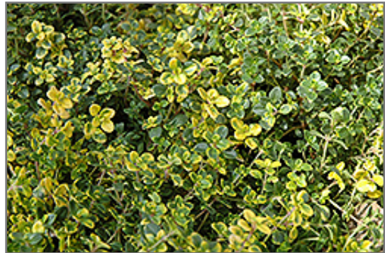
Doone Valley Thyme