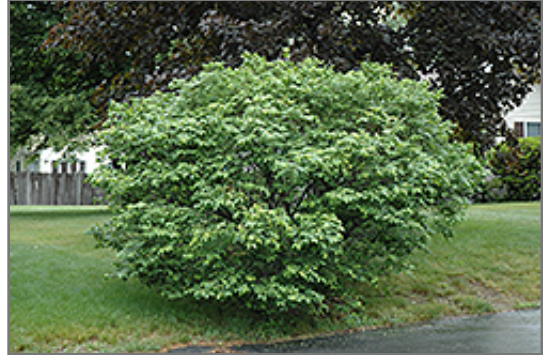
Compact Winged Burning Bush

Compact Winged Burning Bush will grow to be about 7 feet tall at maturity, with a spread of 7 feet. It tends to fill out right to the ground and therefore doesn't necessarily require facer plants in front, and is suitable for planting under power lines. It grows at a slow rate, and under ideal conditions can be expected to live for 50 years or more.