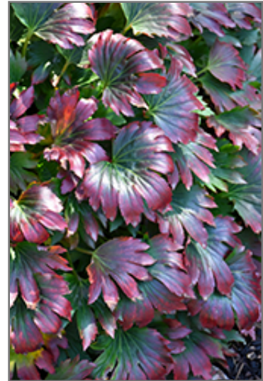
Crimson Fans Mukdenia foliage

This is a relatively low maintenance plant, and is best cleaned up in early spring before it resumes active growth for the season. It has no significant negative characteristics.