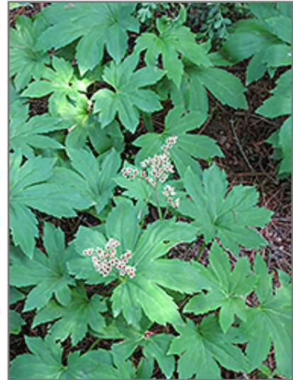
Crimson Fans Mukdenia flowers

Crimson Fans Mukdenia will grow to be about 12 inches tall at maturity extending to 18 inches tall with the flowers, with a spread of 24 inches. When grown in masses or used as a bedding plant, individual plants should be spaced approximately 20 inches apart. Its foliage tends to remain dense right to the ground, not requiring facer plants in front. It grows at a medium rate, and under ideal conditions can be expected to live for approximately 10 years. As an herbaceous perennial, this plant will usually die back to the crown each winter, and will regrow from the base each spring. Be careful not to disturb the crown in late winter when it may not be readily seen!