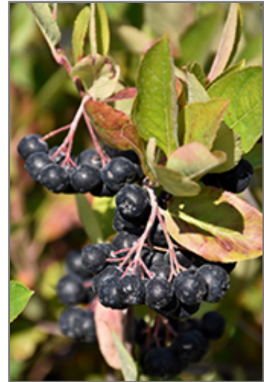
Viking Chokeberry fruit

This shrub should only be grown in full sunlight. It is an amazingly adaptable plant, tolerating both dry conditions and even some standing water. It is not particular as to soil type or pH, and is able to handle environmental salt. It is somewhat tolerant of urban pollution. This particular variety is an interspecific hybrid.