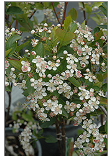
Viking Chokeberry flowers