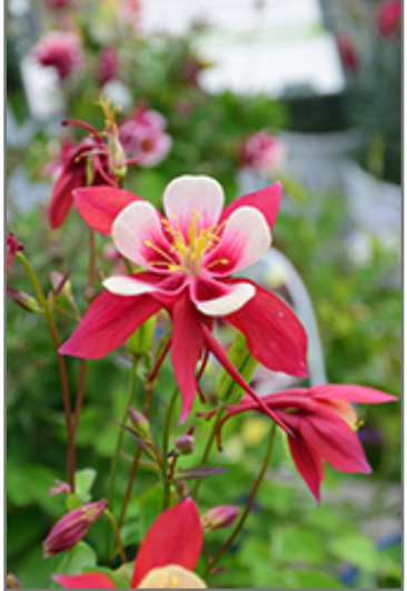
Origami Red and White Columbine flowers

P 204.895.7203 F 204.895.4372 www.shelmerdine.com