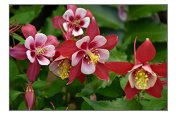
Origami Red and White Columbine flowers