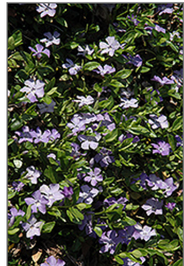
Common Periwinkle in bloom