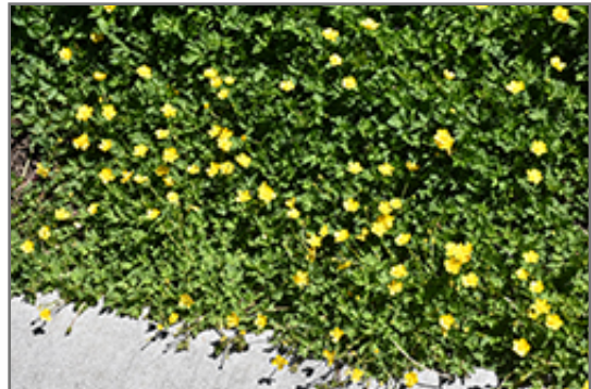
Barren Strawberry in bloom