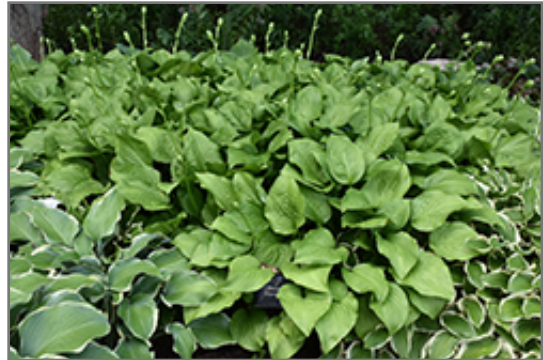
Royal Standard Hosta

Royal Standard Hosta is recommended for the following landscape applications;