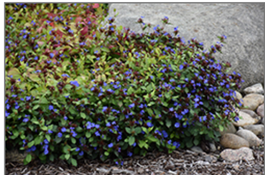
Plumbago in bloom