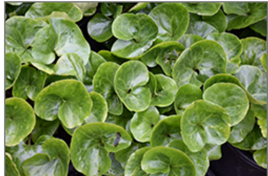
European Wild Ginger foliage Photo courtesy of NetPS Plant Finder