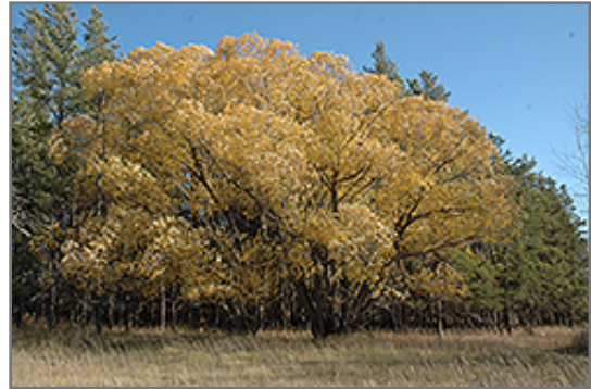
White Willow in fall