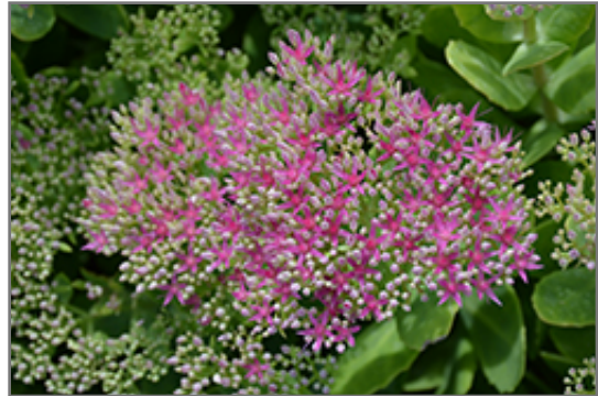
Neon Stonecrop flower buds

Neon Stonecrop will grow to be about 20 inches tall at maturity, with a spread of 20 inches. When grown in masses or used as a bedding plant, individual plants should be spaced approximately 16 inches apart. It grows at a fast rate, and under ideal conditions can be expected to live for approximately 15 years. As an herbaceous perennial, this plant will usually die back to the crown each winter, and will regrow from the base each spring. Be careful not to disturb the crown in late winter when it may not be readily seen!