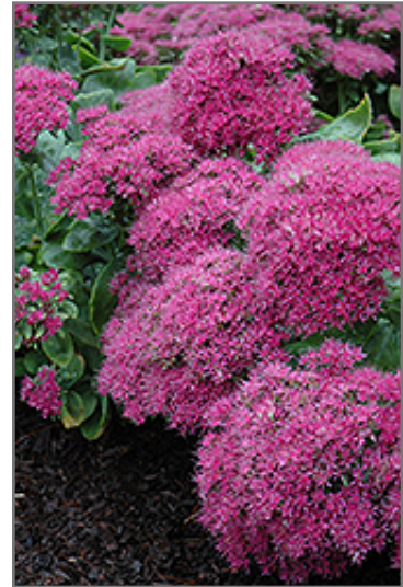
Neon Stonecrop flowers

This is a relatively low maintenance plant, and is best cleaned up in early spring before it resumes active growth for the season. It is a good choice for attracting bees and butterflies to your yard, but is not particularly attractive to deer who tend to leave it alone in favor of tastier treats. It has no significant negative characteristics.