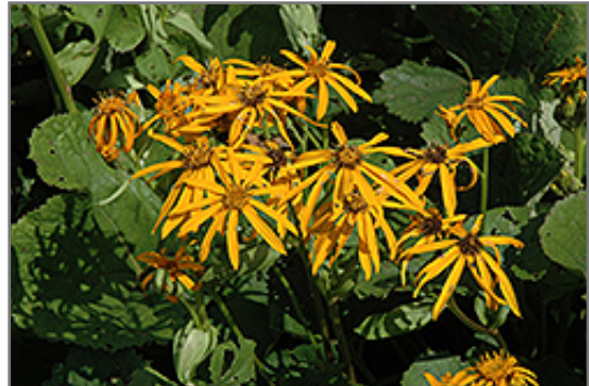
Othello Rayflower flowers