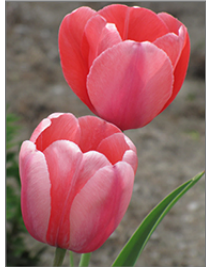
Pink Impression Tulip flowers