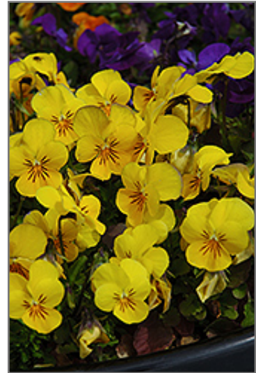
Penny Yellow Pansy flowers