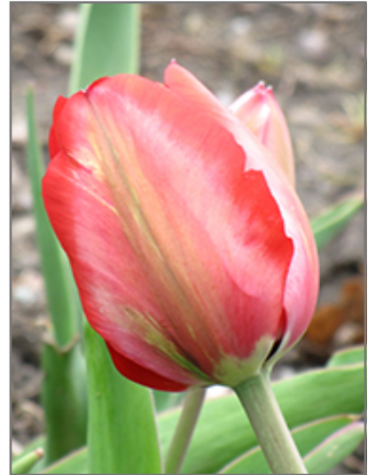
Menton Tulip flowers