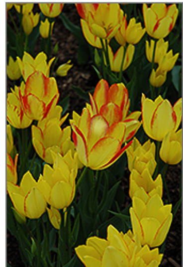
Georgette Tulip flowers

7800 Roblin Boulevard Headingley, MB R4H 1B6