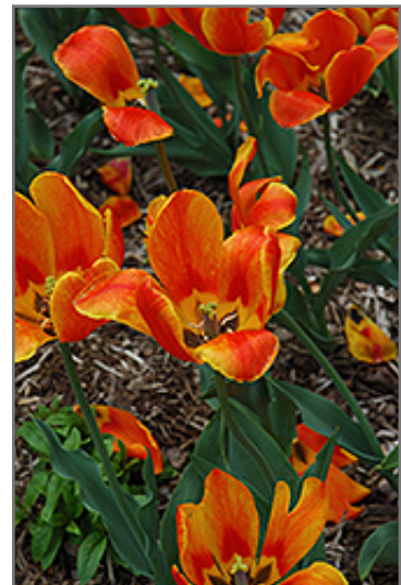
Flair Tulip flowers

7800 Roblin Boulevard Headingley, MB R4H 1B6