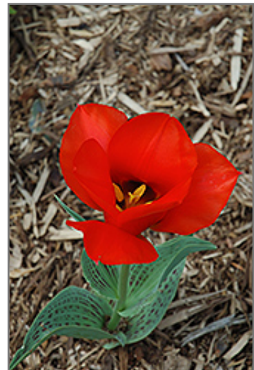
Casa Grande Tulip flowers

7800 Roblin Boulevard Headingley, MB R4H 1B6