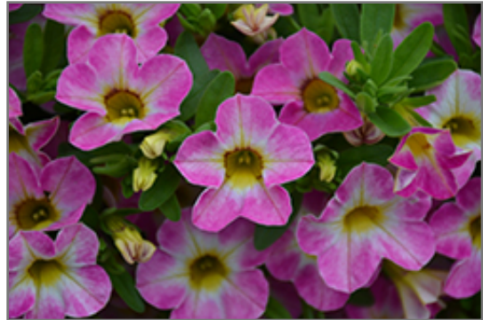
Chameleon Starlet Pink Calibrachoa flowers

Chameleon Starlet Pink Calibrachoa is a dense herbaceous annual with a trailing habit of growth, eventually spilling over the edges of hanging baskets and containers. Its medium texture blends into the garden, but can always be balanced by a couple of finer or coarser plants for an effective composition.