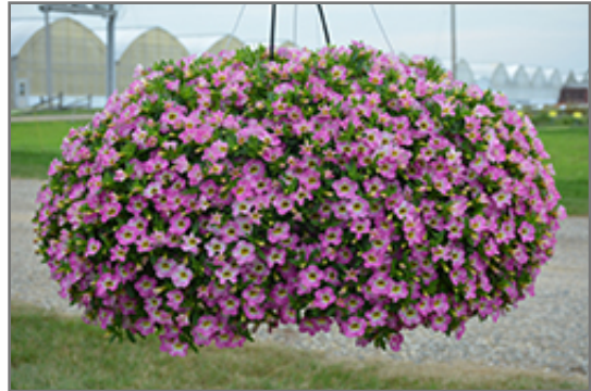
Chameleon Starlet Pink Calibrachoa in bloom